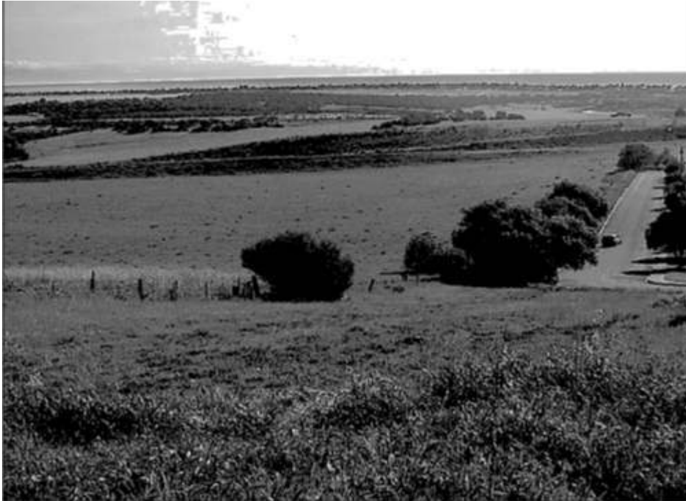
KEEP IN VIEW: Paringa View allotments are set in picturesque countryside